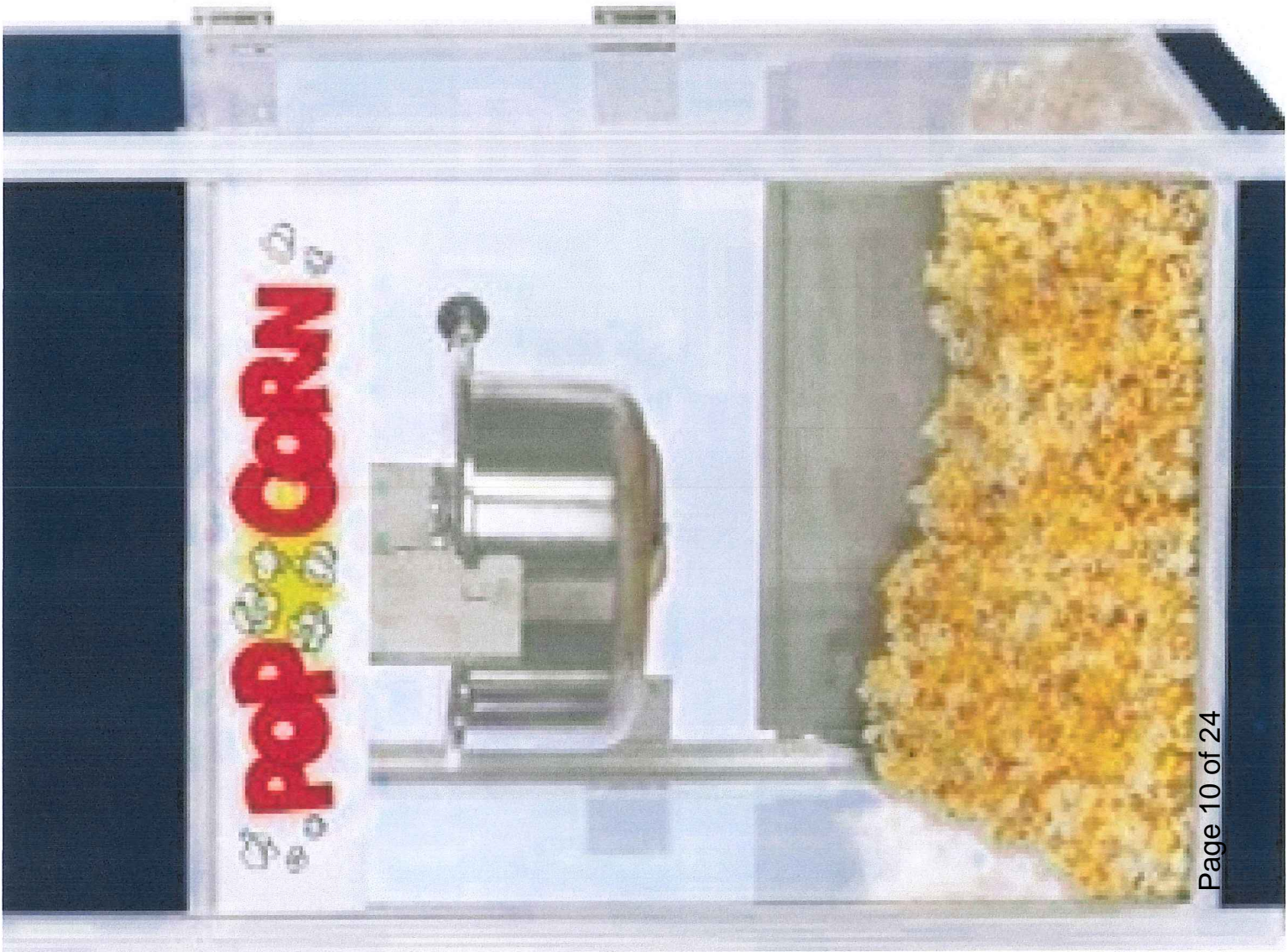
Page 10 of 24